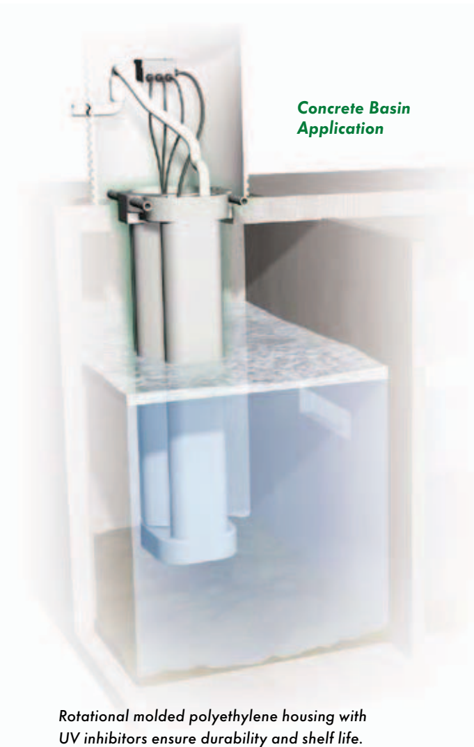
Rotational molded polyethylene housing with UV inhibitors ensure durability and shelf life.