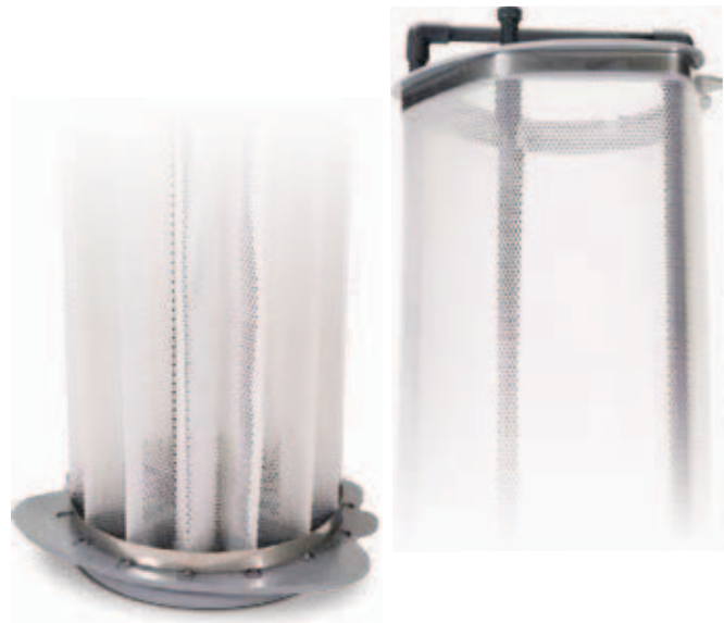
Perforated quality polypropylene medium allows ease of filter cleaning.