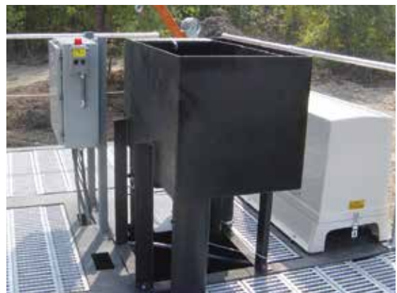
Electric control console and flow proportioning chamber