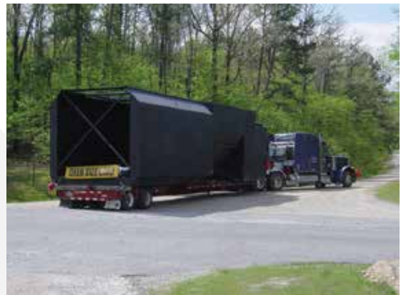
Comes preassembled and ready to hook up