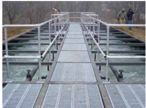
Service walkway for easy attendant access