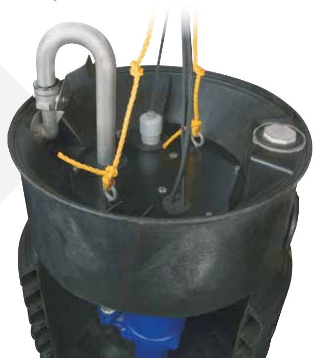
basin not included